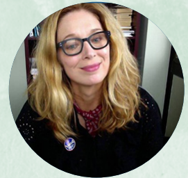
Holly Crocker English Language and Literature College of Arts and Sciences