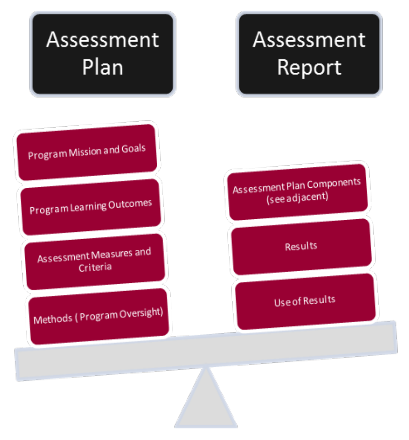
Figure 2: Components of an Assessment Plan/Report

In sum, the assessment report contains eight sections: mission, goals, curriculum, learning outcomes, measures and criteria and methods for program oversight, results and use of results. The university's assessment process requires submission of two assessment reports covering all program learning outcomes in a five year period. The bulk of the assessment report is developed through the course of drafting the assessment plan. In order to have assessment results to report, programs must be diligent about collecting assessment results <u>each semester</u>. However, there is no requirement to submit an assessment report each semester. Instead, programs are asked to collect assessment results and store student performance in APC (the assessment software system?) for discussion in the semester that the report is due. The Illustration below best represents the distinction between the sections included in the assessment plan and the assessment report.