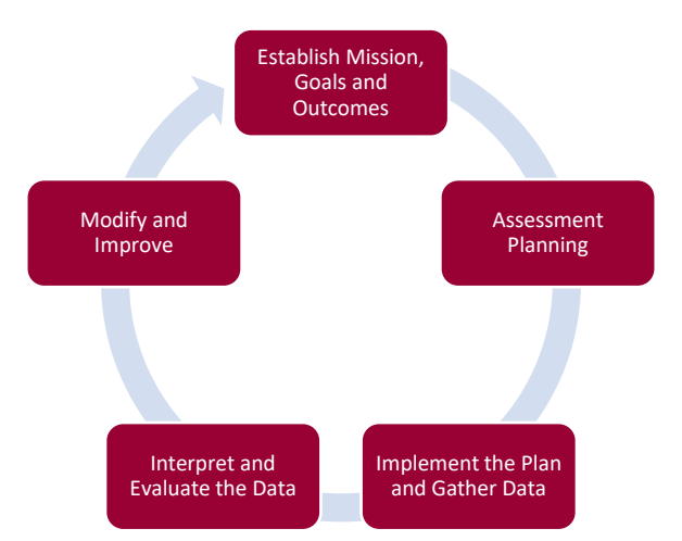
Figure 1: Academic Program Assessment Process